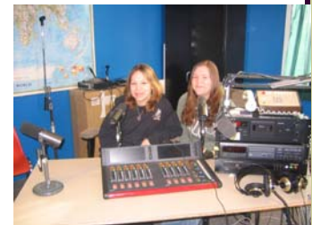
Youth at KMXT