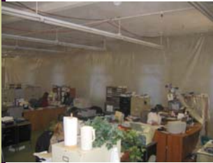
Working in the plastic