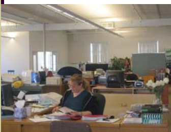
Our new office Nice and bright

Financial Aid. The earlier this is done the better chance of financial aid. You can apply for financial aid on line at www.fafsa.ed.gov . It is important for you to make sure that your Financial Aid Officer signs off on you financial need sheet and mail or fax it to the Sun'aq Tribe. Although you may not be eligible for Pell grants, you must establish financial need before you receive a BIA Grant. 3. Apply to other sources of funding (i.e. Alaska Student Loan, Native Corporation scholarship, etc.). 4. Submit the documentation listed on the Higher Education Checklist