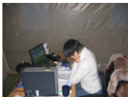
Working in the cold Under the plastic